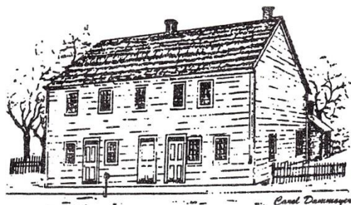
(The Luelleman House)